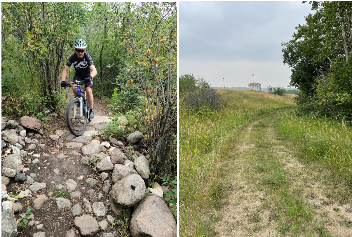
Rocky Road (each lap), the ski hill (follow on the start loop)

The East Qu'Appelle Cartel is looking forward to welcoming you to our trail system. The course is rideable at all ability levels and will be closed to the public the day before and on race day during pre-riding and racing.