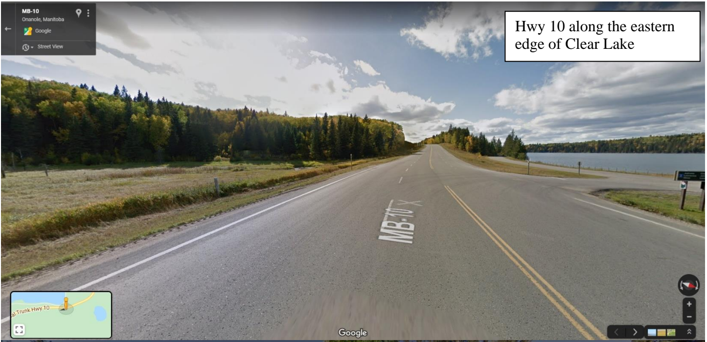
Hwy 10 along the eastern edge of Clear Lake