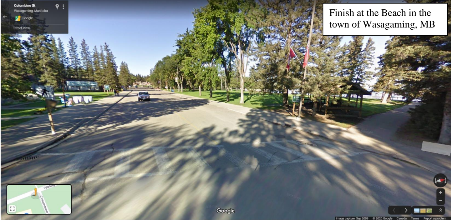
Finish at the Beach in the town of Wasagaming, MB